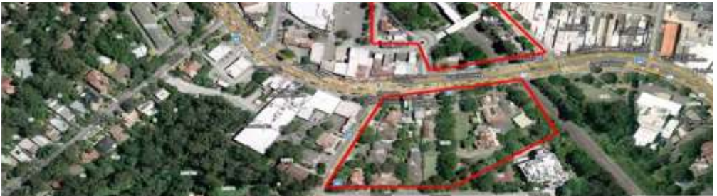
Aerial photograph of Turrumurra Railway Station, Turrumurra Village Park, Turrumurra Lookout Park, 'Hillview' and Hillview Heritage Conservation Area — bounded by Pacific Hwy, Bassingpoint Road and Boyd Street, Turrumurra.