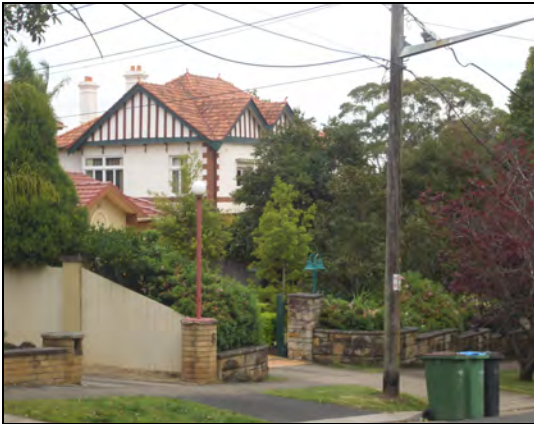
Above: Pymble Ave home set in landscaped gardens.