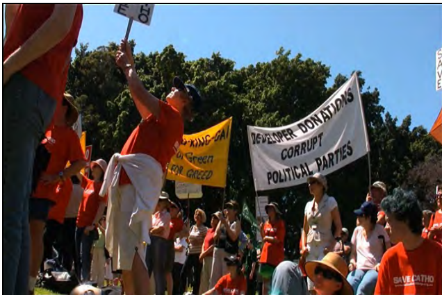
Above: RAID (Residents Against Inappropriate Development) Rally 2008 marches to Parliament House, Macquarie Street, Sydney.

"I AM ABSOLUTELY CONFIDENT (ABOUT THE NEED FOR A ROYAL COMMISSION), BECAUSE I KNOW WHAT THE SIGNS OF CORRUPTION ARE".