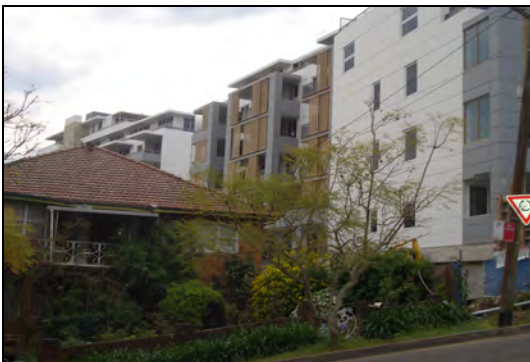
Above: massive apartment blocks totally alien to their context dominate Pymble Ave homes and streetscapes