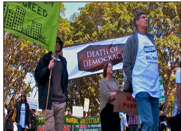
Above: Death of Democracy Rally 2009 marches to Parliament House, Macquarie Street with a renewed call for a Royal Commission into planning.