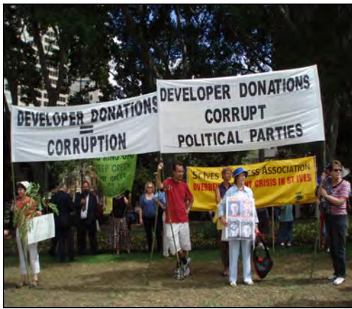
Above: Protesters in Hyde Park 2007.

Sydney Morning Herald 21 September 2010 (Emphasis added)