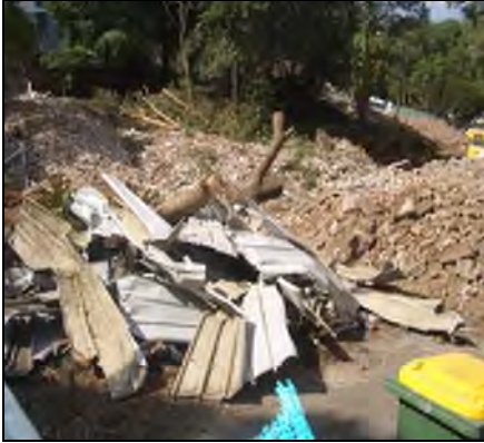
“Strip Mining of Ku-ring-gai” - Sites are moonscaped, towering canopied trees felled.

“The destruction # of Ku-ring-gai at the hands of state-appointed planners has been sad, unconscionably wasteful, unnecessary and irreversible. It has resulted not only in devastated streets, but in the complete disillusionment of local residents who were cynically ignored by their government. It must never happen again. (# Electronic version of this newsletter provides a link to the powerful documentary State of Siege produced by Ku-ring-gai resident Dennis Grosvenor www.tropicofoz.com.au )