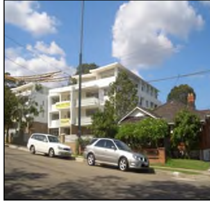
Another Ku-ring-gai hot-box rises over its neighbour & holy car park. An ugly sewerage pipe towers over all.