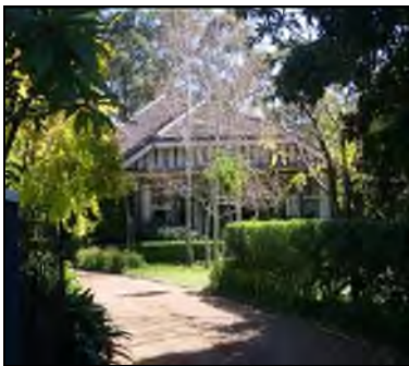
Demolished 6 Culworth Ave Killara in a Potential Conservation Area

Given the significance of the National Trust-Identified Areas, FOKE is most concerned that only 7 of the National Trust-Identified Areas are included in Council's current " Heritage Conservation Area Review North ". With the exception of Council Areas 23, 25, 27 and 28, the National Trust-Identified Areas in the north are greatly reduced or not recognised at all, leaving these National Trust-Identified Areas exceedingly vulnerable and exposed to more unsympathetic infill development and to gross and inappropriate development. This is unacceptable. While some people may believe that HCA controls are an extra level of interference by councils, studies have shown that HCA controls lead to increased amenity and enhanced property values. FOKE strongly supports HCAs.