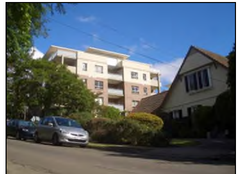
Its unacceptable impact. There are more examples of appalling outcomes.