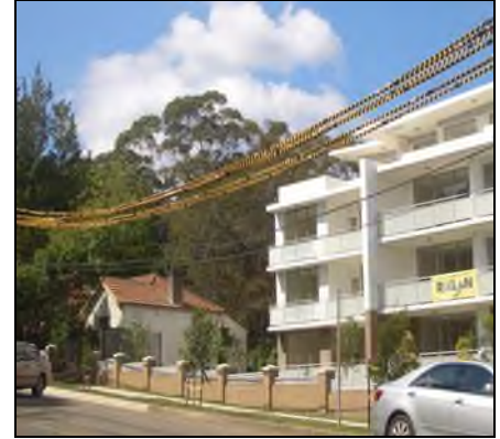
“Before” cooling, carbon absorbing trees contrasted with “After” - energy-guzzling air-conditioned flats

We must learn from Ku-ring-gai that getting density right is entirely a matter of execution. Medium density can be as brutal and destructive as a six storey Ku-ring-gai “egg crate” or as graceful and enduring as a Paddington terrace house. Architectural history teaches us that there are many building typologies — including terrace houses, semi-detached dwellings and Miesian courtyard houses — which increase density while maintaining and even improving the natural environment. It is a disgrace that increased density has been treated by planners as a kind of cod liver oil to be forced on local communities regardless of their situation. Houses should not be off the rack commodities, designed for the ideal consumer.