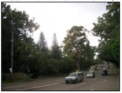
Before: A Pacific Highway streetscape.