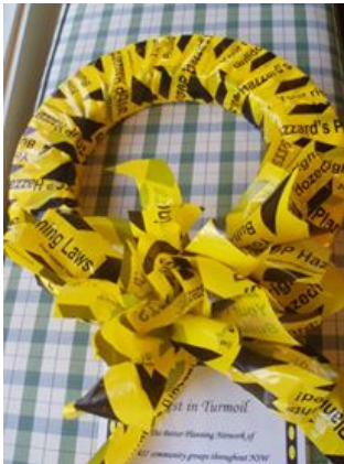
"Hazard tape" became a familiar sight around Kur-ing-gai this year.

"...no rights of judicial review or third party merit appeals would be available to the council or public..."