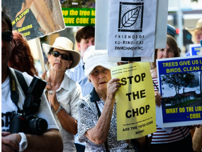
FOKE members protest changes to the Clearing Code in 2014.

By banding together with other groups around NSW and in Ku-ring-gai to fight the developer-driven planning legislation changes, FOKE and you—our members—have made a significant difference to what is occurring in our environment.