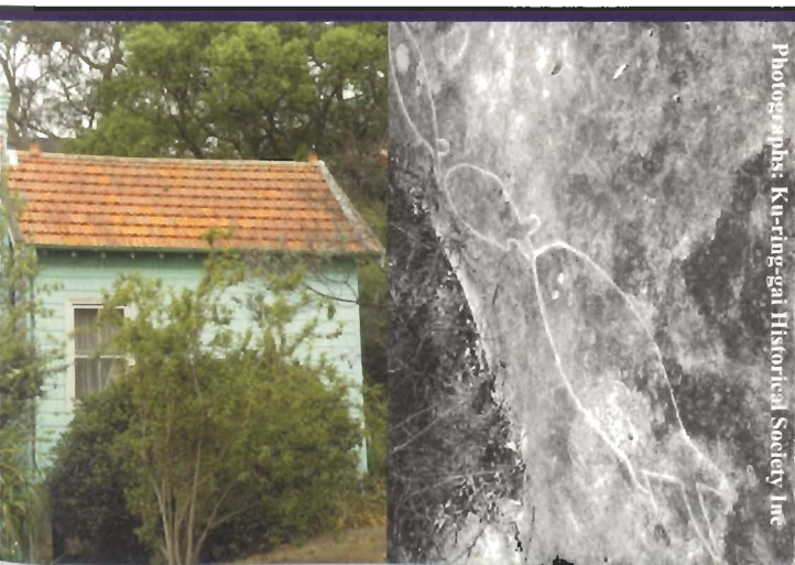
Photographs: Ku-ring-gai Historical Society Inc